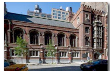
PCMH's West Side Rehabilitation Center, home to the West Side Clinic, closed its doors this summer after nearly 40 years.

Its closing has meant the relocation of the West Side Clinic and three PCMH programs also housed there—Personalized Recovery Oriented Services (PROS), Scatter Site, and Making Healthy Choices.