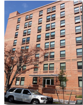
PCMH’s Crotona Park North Residence in the Bronx is home to 50 residents, and overlooks a picturesque expanse of treetops.

PCMH’s Crotona Park North Residence, set on a quiet street overlooking the expansive green of Crotona Park in the Bronx, opened its doors on May 27, 2014. Walking into the bright, gleaming lobby of the modern brick building, the scent of new construction fills the air, conveying the sense that this is very much a place for new beginnings.